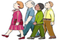
Calling All Seniors!

The Senior Citizens meet on Mondays at 2.15pm. We have a varied and entertaining programme. All are very welcome. It is hard to believe that we are almost at the end of another successful session, but our programme for March is