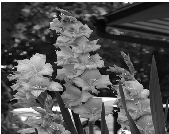
Gladiolus: Strength of character, Love at first sight, Generosity