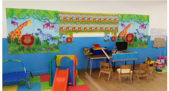
The Toddlers' Room with our Noah theme