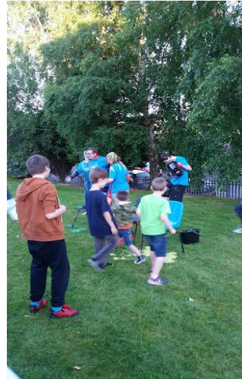
Barbecue night - More mess!! But great fun